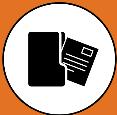
Client charts left unattended