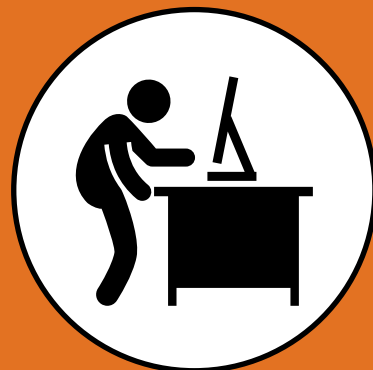
Inappropriate access to records/snooping